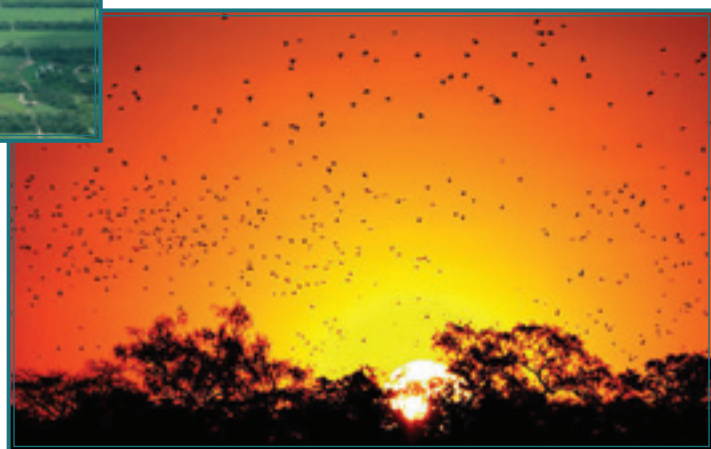
Eared doves returning by the thousands to roost

The hunting day also resembles Mexico in that the birds fly primarily between 7 a.m. and 10 a.m. and then again mid to late afternoon—providing a nice break in the middle of the day. During this break hunters can either return to the lodge for lunch and a nap or they can opt for a wonderful asado picnic of grilled meats and game birds, salads, fresh baked breads, etc. and rest in a hammock or on a cot.