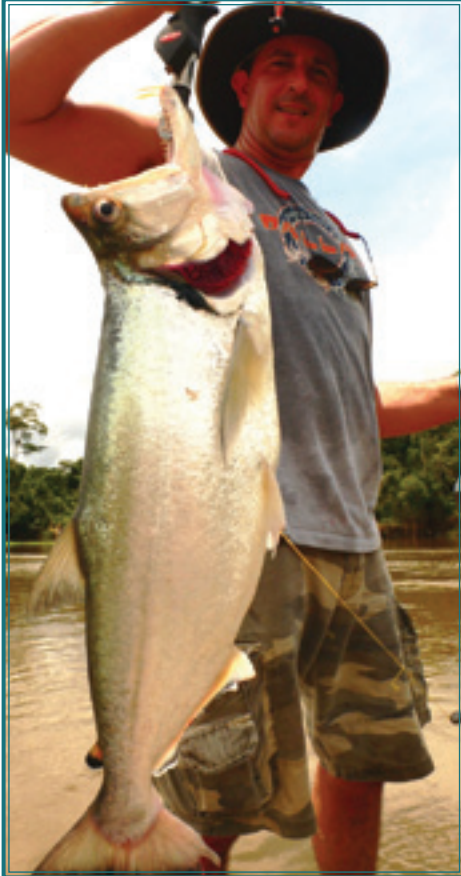
Payara — the Amazon's "tarpon on steroids."

steroids," these payara range from 10 to 30 pounds and can exceed 50 pounds! Ten to fifteen hookups a day is the norm on payara.