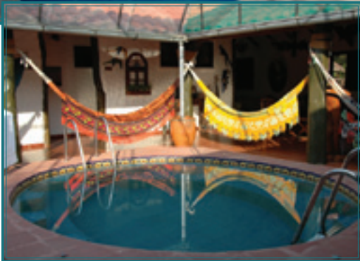
Las Palomas has a great hot tub for soaking tired bodies