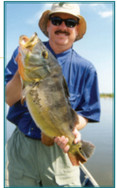
Baitcasting, spincasting and fly fishing are all effective.

For sheer numbers of fish and variety of species, no other location in the world offers better fishing than the Bolivian Amazonas region.