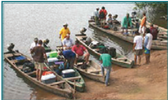
We use specially made very long, very stable dugouts

For additional information and images, please visit us online at www.boliviahuntingandfishing.com