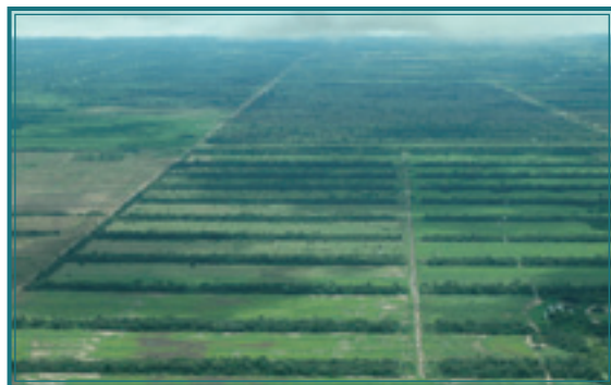
Cortinas of crops and tree lines — home to literally millions of doves

Bolivia is truly the new frontier for world-class eared dove hunting. The habitat, feeding flights and style of hunting closely resembles the classic era of Mexico