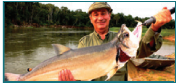
Ferocious payara up to fifty pounds abound in the rivers.

Santa Cruz, a surprisingly international and sophisticated city of 1.2 million, is the jump-off point easily reached from Miami. The flight is only six hours as opposed to Argentina, which is nearly twice as far.