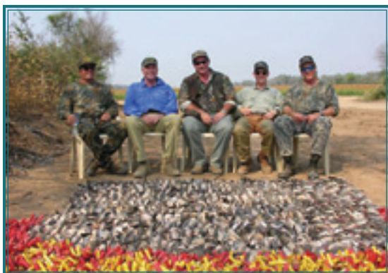
Taking a moment to rest weary shoulders

whitewing shooting at its best — flock after flock pouring into grain fields from surrounding roosting areas and then later returning to those roosts in larger flocks. There is one main distinction: in the bountiful plain of Bolivia's Gran Chaco region, there are vastly greater numbers of birds — a truly astonishing sight. At points during the morning and afternoon feeding flights it is possible to see thousands and even hundreds of thousands of birds in all directions!