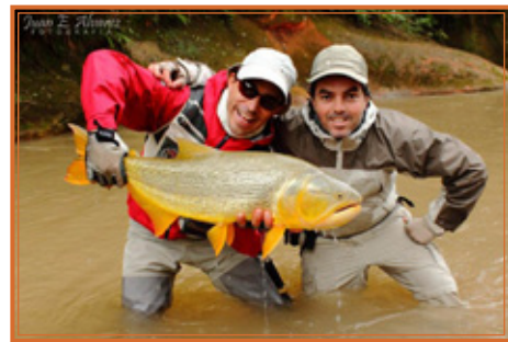
Rio Seco dorado on the fly

A six to eight-weight fly rod is recommended with floating and sink tip lines. Deceiver, clouser or muddler patterns on 1/0 and 2/0 hooks with combinations of black, blue, brown or red with white underbodies, tied with deer hair or bunny fur work well. Spin/baitcasting fast-action