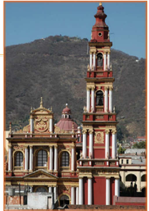
Salta has many Spanish colonial sites.

Salta Province is one of Argentina's most visited areas. The city of Salta, capital of the province, was founded on April 16th, 1582 by Hernando de Lerma, governor of Tucumán on the orders of Spanish officials in Perú, placing it in such a beautiful and fertile valley that to this day the city is called "the beauty." Outside of the city several regions feature traces of pre-Columbian