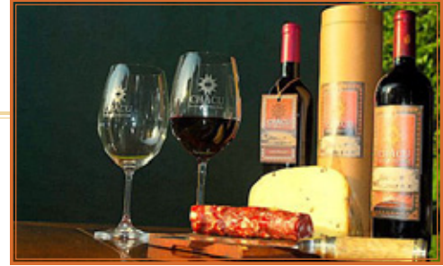
Salta Province has renowned wineries/vinyards.

Besides the amazing dove hunting, guests also have the option to shoot spot-winged and picazuro pigeons or spin or fly fish for South America's renowned golden dorado, whose reputation for hard strikes, acrobatic leaps and finger-burning runs makes them one of the world's most sought-after