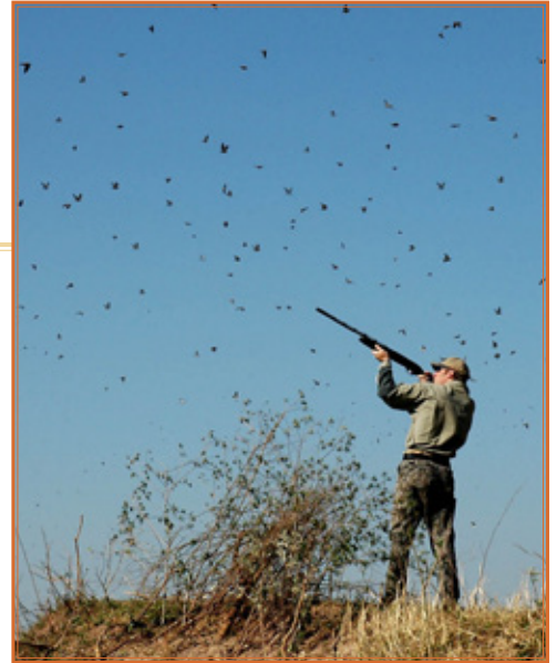
Waterhole gunning for eared dove

Our knowledgeable staff will expertly arrange all aspects of your trip-of-a-lifetime, so call us at 1-800-211-4753 today for details and be one of the lucky sportsmen who experiences Salta's amazing shooting and fishing.