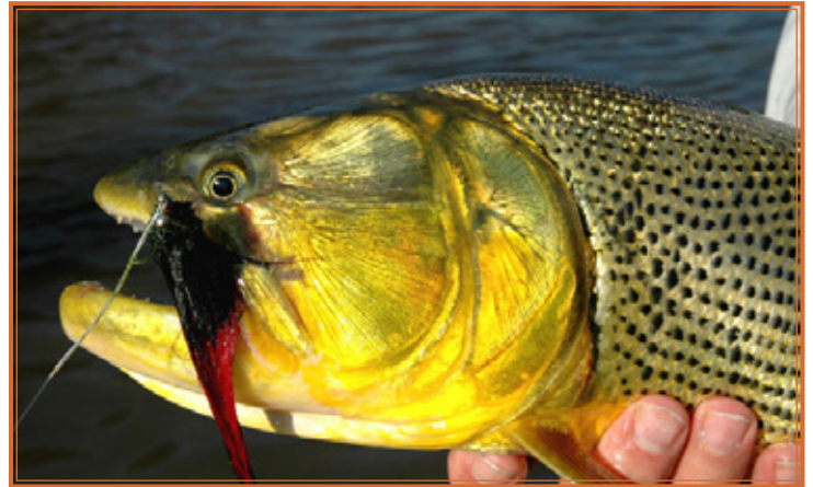
Golden dorado are gorgeous fish.

rods are recommended to cast 2" to 4" diving minnows and 1/4 oz. to 1/2 oz. silver and gold spoons and spinners.