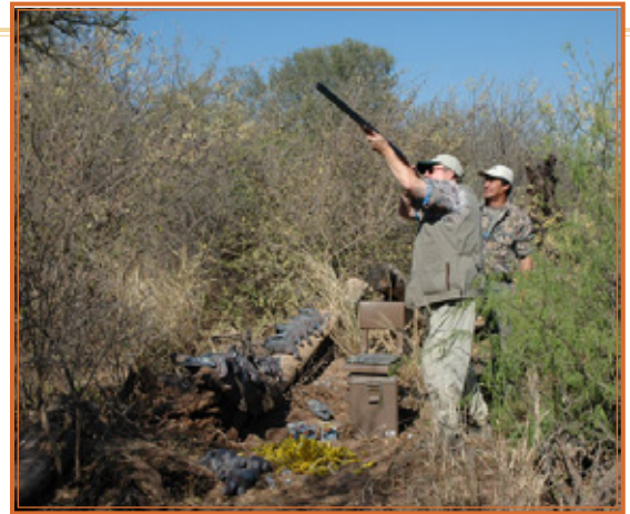
Ambushing Argentine pigeons.

One of the great aspects of a bird hunt in Salta is the uncommon variety of shooting platforms. For example, one day hunters may be positioned in the midst of a huge roost, the next around the perimeter of a harvested grain field, the next down in the river bottom or over a waterhole and