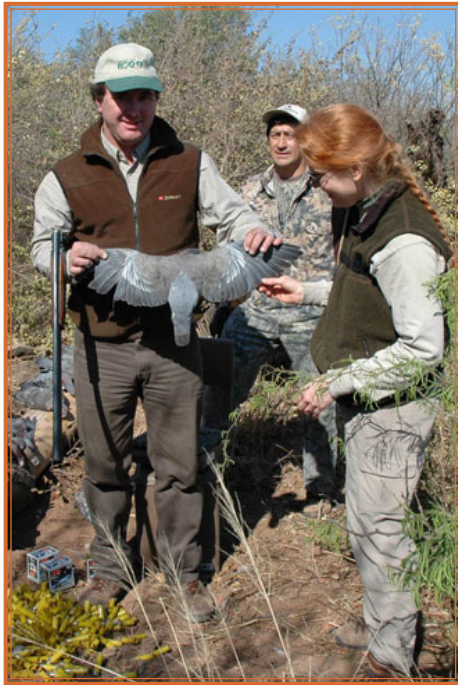
Salta has huge numbers of wild pigeons.

"Imagine hearing the subdued yet audible roar of more than a million eared doves' wingbeats as the birds erupt from late-afternoon feeding fields. Rolling in waves across harvested soybean and peanut fields, the doves accumulate in locust-like swarms, then join undulating flight lines headed for the nearby roost. Like spokes in a wheel, incoming flights approach to refill the staging and watering areas, then depart for their nighttime haunts. Words cannot do justice to such an awe-inspiring spectacle of nature."