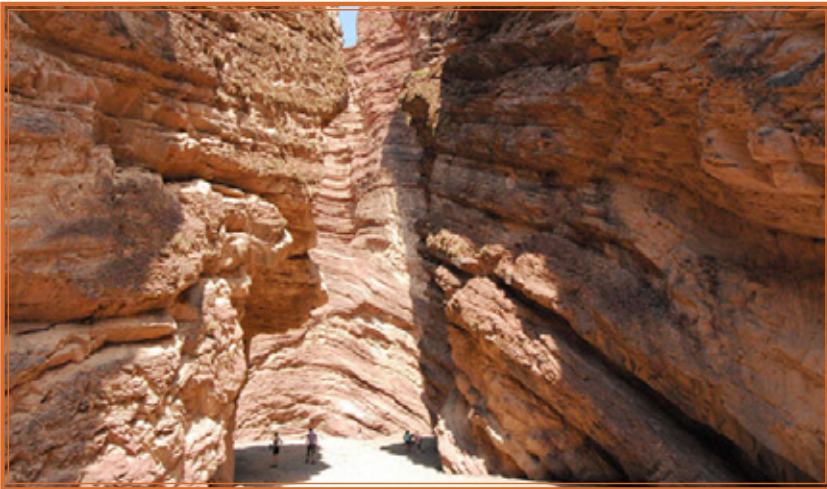
Southern and northern Salta have amazing geologic sites.

cultures, mingled with ruins of indigenous villages, together with forts and buildings dating back to the time of the Conquest and Colonization.